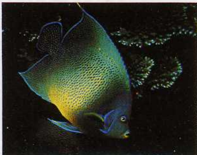
Angel Fish near Sugarloaf Island

A slim crescent of land, eleven kilometres in length, with dramatic mountains and luxuriant palm forests, Lord Howe Island is the exposed part of a long dead volcano, which erupted out of the sea in pre-history.