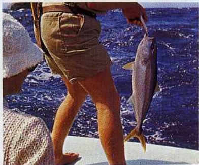
An average size catch

And at the southern end of the island, Mt. Gower offers its lofty head for you to climb and meet the Lord Howe Island Woodhens, now one of the rarest species of birds in