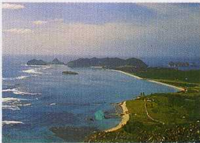
View from Mt. Lidgbird

Or a whaling station. There were a dozen plans for exploitation. Miraculously, none of this happened. And the island was allowed to live with only occasional visits from passing ships until the first settlers arrived in 1834. And even then, the simple farming of these first Lord Howe Islanders scarcely disturbed the ecology. The island was too far away from the mainland, seven hundred kilometres from Sydney. It was too remote from the world's shipping lanes. There was no safe