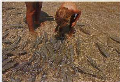
Fish come in from the sea for you to feed by hand

And with all this, there is the fabulous welcome which is the reputation of the Islanders, and which has made Lord Howe Island one of the friendliest islands in the world. Come soon.