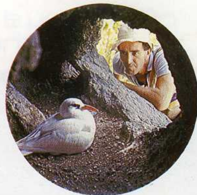
Red tailed tropic bird (bosun bird)

anchorage. So Lord Howe Island received the one priceless gift civilisation then had to offer. Neglect. A neglect that lasted long enough for its unique beauty to be recognised and protected by Act of Parliament.