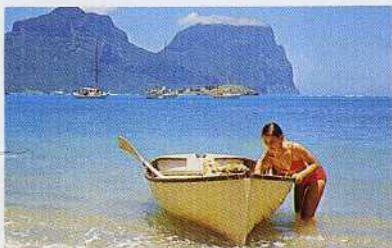
Boating on the lagoon

Gentle walks through rich vegetation. Incredible and breath-taking views. Soft sand on secluded beaches. Colourful coral and marine life.