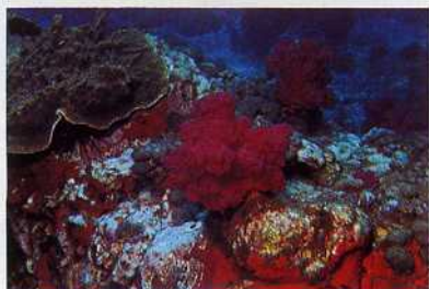
Colourful coral